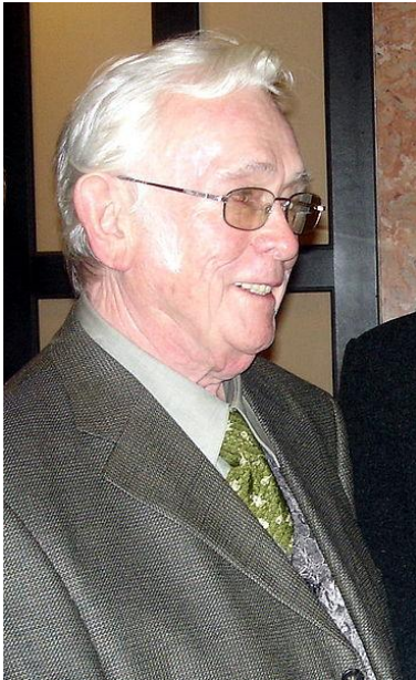
Obrázek 1 Josef Škvorecký

2. Describe what you can see in the pictures and find out how it is connected with Canada, use the Internet, maps, other sources: