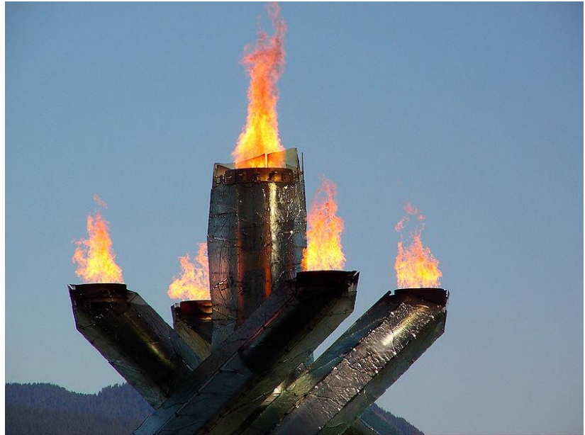
Obrázek 3 Vancouver Olympic Flames