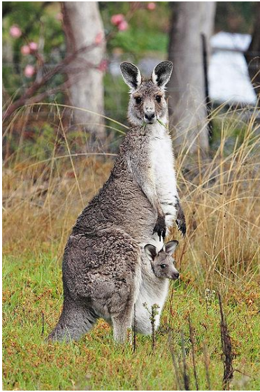
Obrázek 1 kangaroo

2. When going to Australia, you can meet a lot of unusual animals that do not live anywhere else. Can you match the pictures with their names?