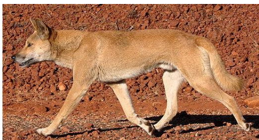
Obrázek 4 dingo

3. There is a piece of information about each of the animals, match them to them: