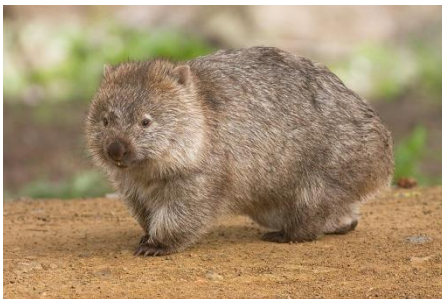
Obrázek 3 wombat