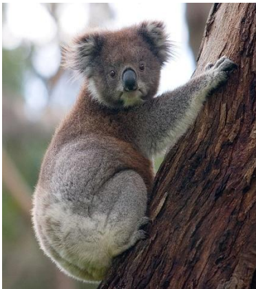
Obrázek 2 koala