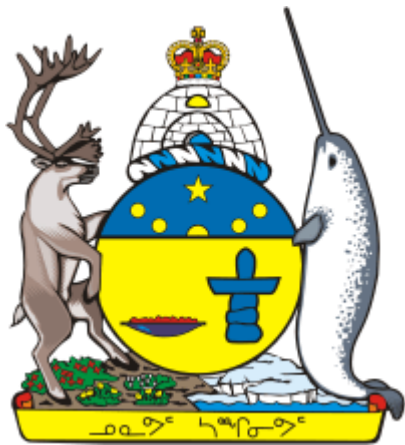
Obrázek 2 Coat of Arms of Nunavut