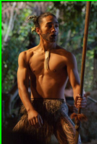
Young Maori man performing in a kapa haka group